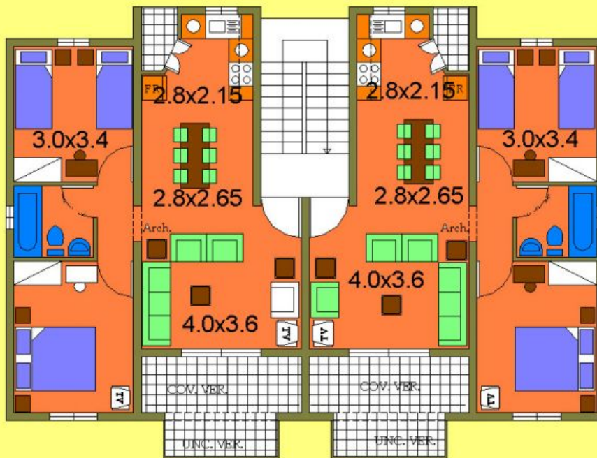
Limnos Block E 2 bed apt's 208/209